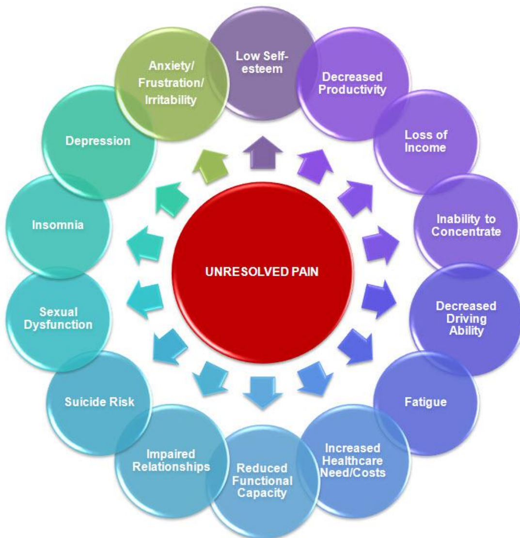
Figure 2. Consequences of Unresolved Pain.

The first portion of this article presents a very basic review of the pharmacology of the cannabinoids and endocannabinoid receptor system, drawing both from animal and human models. 6 Although cannabinoids have putative therapeutic